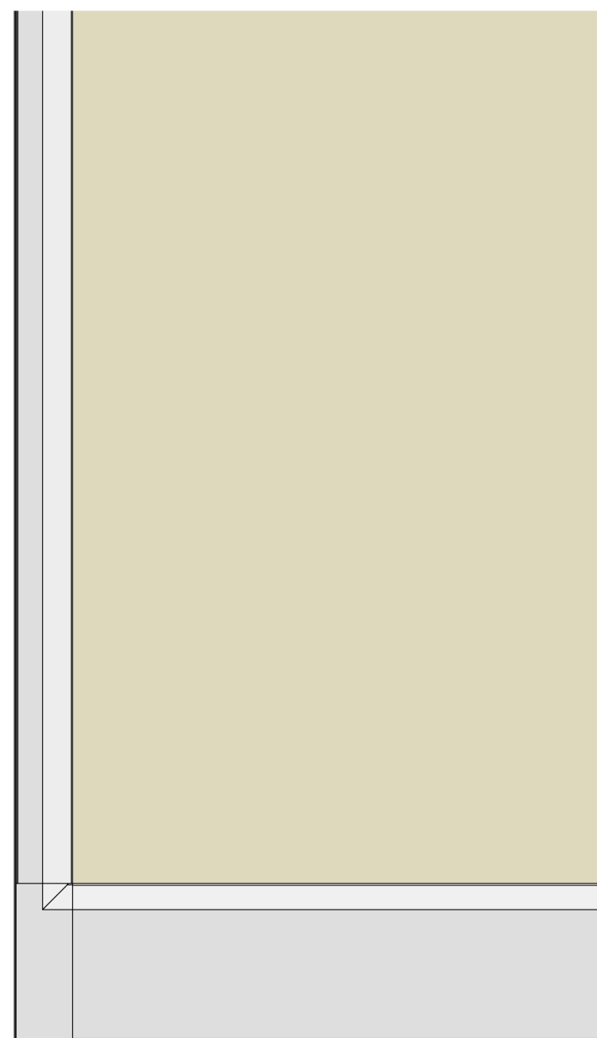
3 Elevation. Transition skirting SA-14-150-5x5 to vertical post SA-3.1-no flash gap