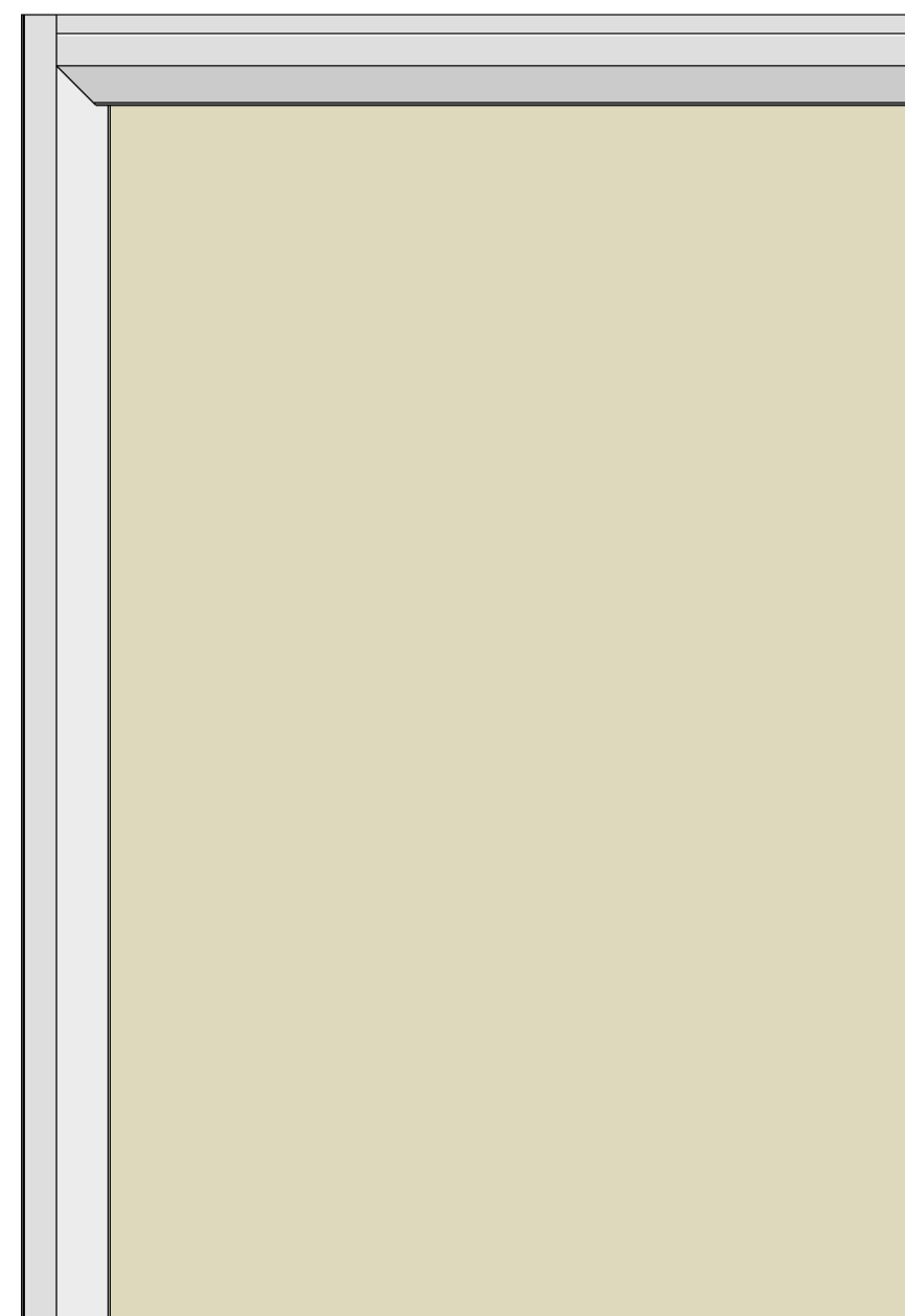
1 Elevation. Transition head detail SA-13-57-12-45 degrees to vertical post SA-3.1-40mm