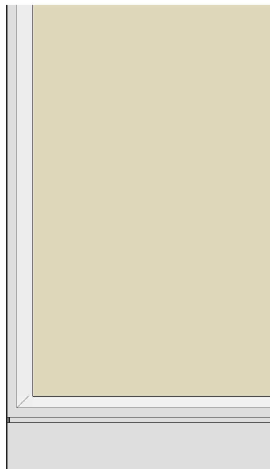
3 Elevation. Transition skirting SA-14-157-12x12 to vertical post SA-3.1.-12mm