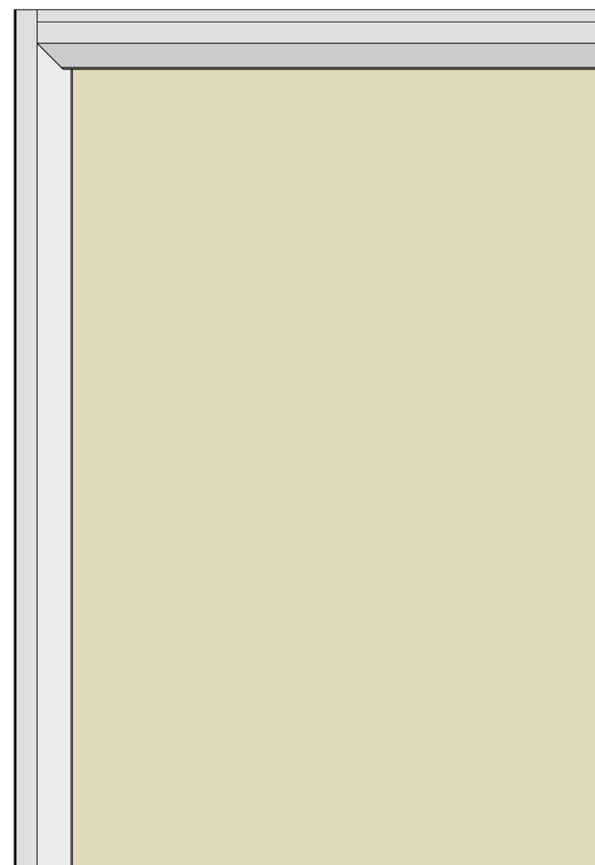
1 Elevation. Transition head detail SA-13-57-12-45 degrees to vertical post SA-3.1-12mm