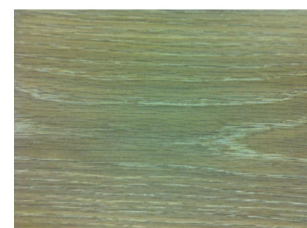
1 Section SA-15-150-40X40 1:5