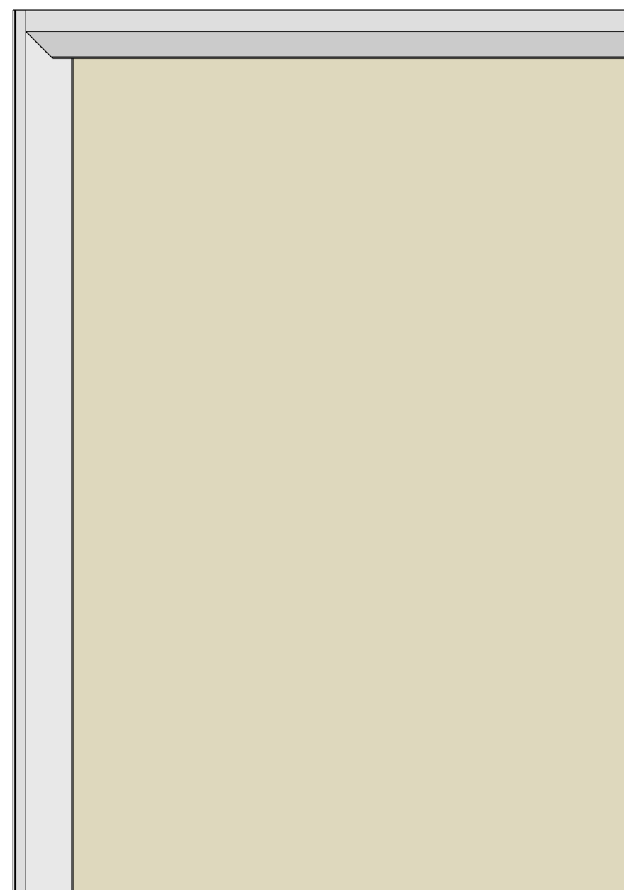
1 Elevation. Head detail SA-12-45 45 degrees for transition to vertical post